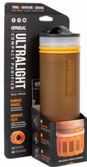
ULTRALIGHT COMPACT PURIFIER BOTTLE