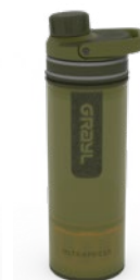
OLIVE DRAB 500-ODG 7995