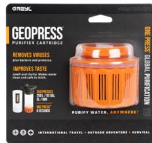
GEOPRESS® REPLACEMENT PURIFIER CARTRIDGE