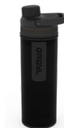
COVERT BLACK 500-COV 7995