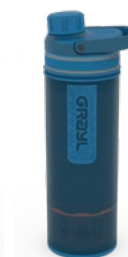
FOREST BLUE 500-FOR 7995