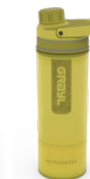
FORAGER MOSS 500-MOS 7995