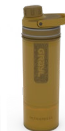
COYOTE BROWN 500-CBN 7995