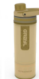
DESERT TAN 500-DTN 7995