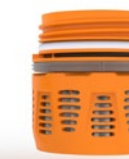
ORANGE 505-PC-OR 2495