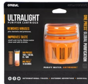
ULTRALIGHT REPLACEMENT PURIFIER CARTRIDGE