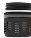
BLACK 505-PC-BK 2495