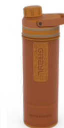
MOJAVE REDROCK 500-MRR 7995