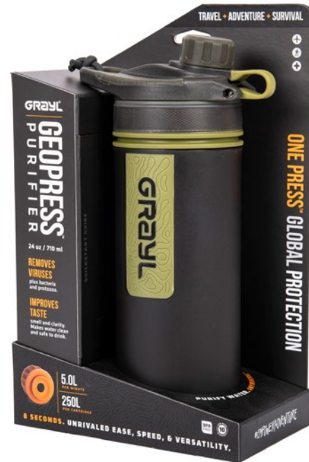
GEOPRESS® PURIFIER BOTTLE

Grayl sets itself apart on shelves with an in-store presentation that is above the rest within water purification. Our unique and well communicated package design is indicative of our commitment to retail and is a significant contributor to our growth within the category.