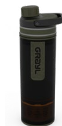
CAMP BLACK 500-CMP 7995